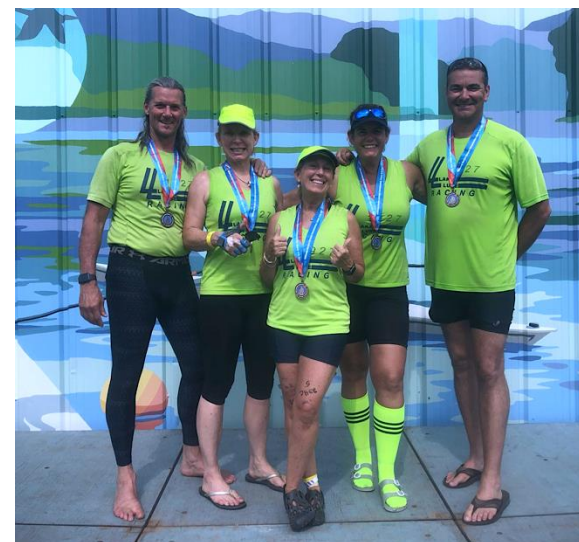
Lake Lure Racing's 2021 National Championships Bronze Medal winning Mixed 4+ Coxswain crew.